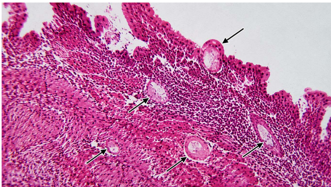
Figure 3. A histological section taken from the esophagus of a wild pigeon infected with microscopic Sarcocystis , with dense inflammatory cellular infiltration in the areas surrounding the cysts. The arrowheads indicate the locations of the pineal cysts. The section was examined at (40x and eosin and hematoxylin stain (H& E).