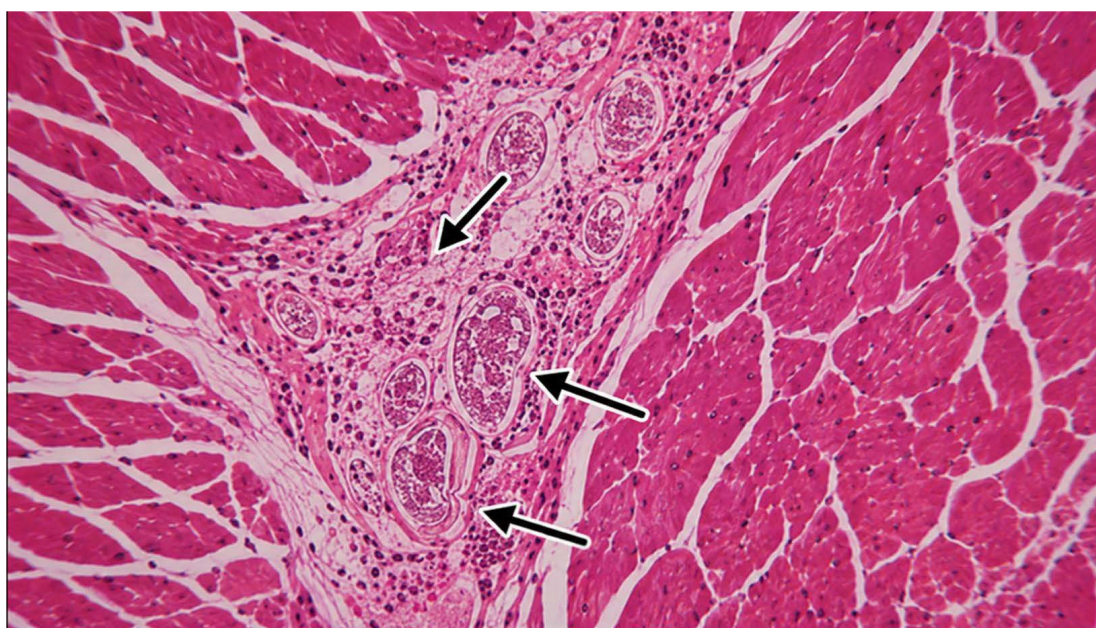
Figure 4. A histological section of the chest muscle of a domestic chicken infected with Sarcocystis , showing numerous parasitic cysts distributed among the muscle fibers with significant inflammatory infiltration affecting the tissue structure. The arrowheads indicate the locations of Sarcocystis . ( 40x eosin and hematoxylin H&E).

histological reaction associated with the infection. These results illustrate the pathological effect of the Sarcocystis parasite in esophageal tissue, as shown in Figures 3 & 4 .