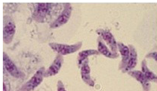
Figure 2. Sarcocystis Bradyzoites in Digested Samples After Staining With Giemsa ( \times 1000 )